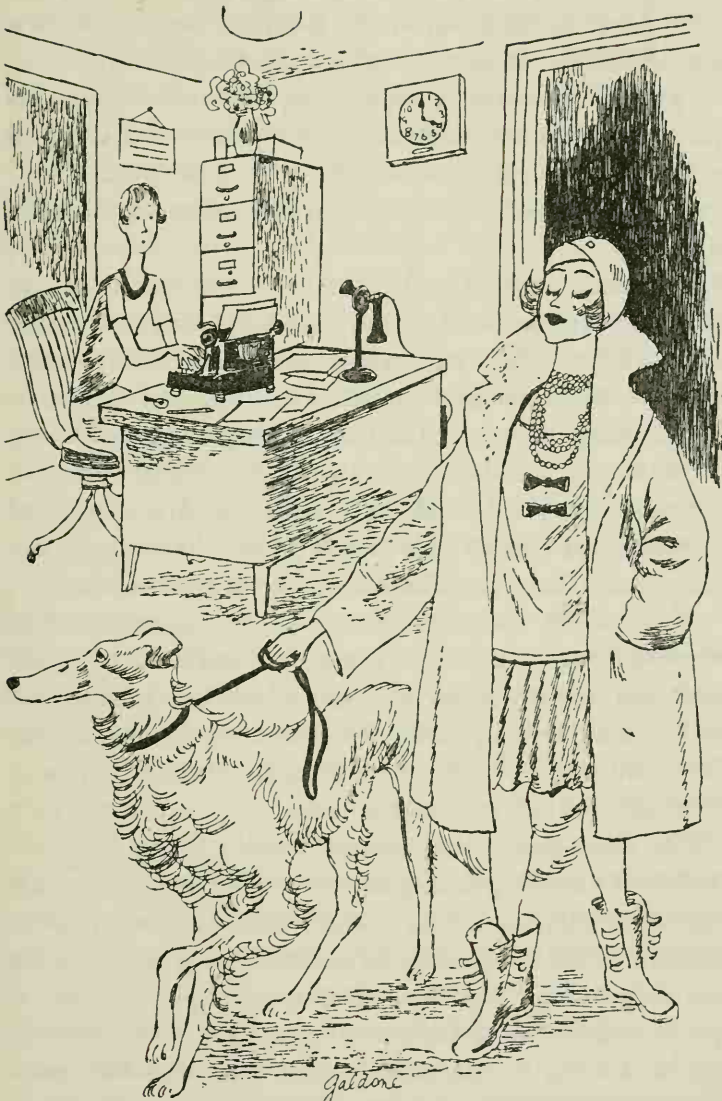
An apparition in a white polo coat, white velvet hat, white galoshes, and a white wolfhound on a leash